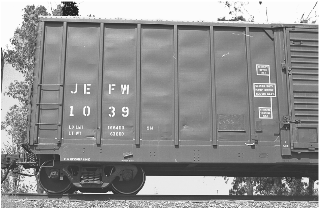
Left side of JEFW 1039 clearly shows how easy these are to identify.