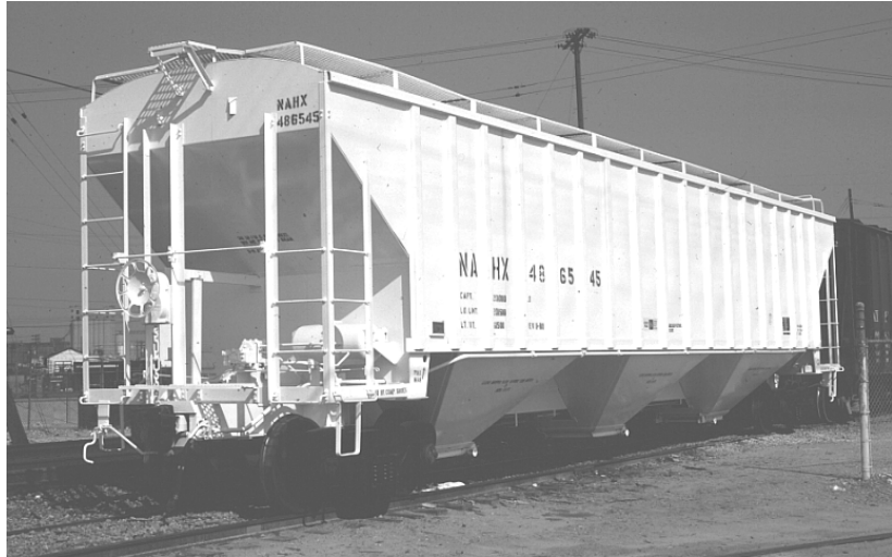
NAHX 486545. An example of a 4750-cubic-foot covered hopper - still the most commonly seen grain & potash covered hopper on GERSCO's roster.

In 1984, the former North American Car Corporation became General Electric Railcar Services Corporation (or GERSCO). Since that time former Pullman Leasing, Itel, Brae, Evans, Rex Leasing, and SSI have all become part of GERSCO. Most recently, most of the freight car assets of ACF were acquired by GERSCO (ACFX initialed cars). The current Register lists nearly 120,000 cars under GERSCO "home" reporting marks - this does not include those cars operating under railroad reporting marks!