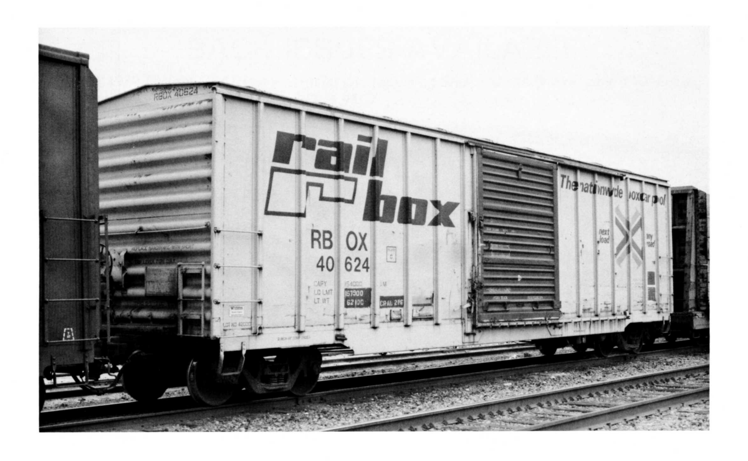
(Above) RBOX 40624 was built in 1980 as part of Lot 42000. (Below) TLDX 60001 was built as part of Lot 11000-1 in 1970.