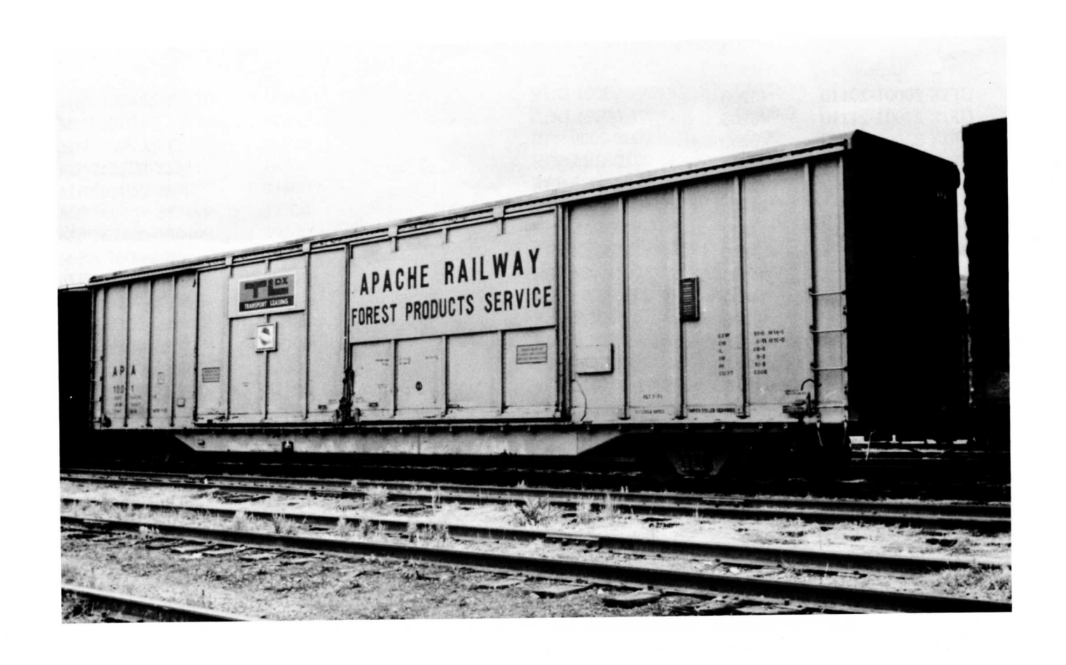
(Above) APA 1001 was built in 1970 as part of Lot 11000. Note the huge 34'6" door opening. (Below) DM 20279 was built in 1979 as part of Lot 41100. This is a standard Berwick 50-foot Plate C box car design.